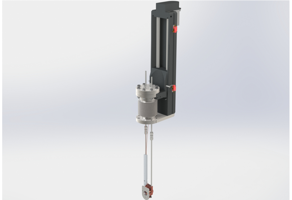
Faraday cup with fixed perpendicular mounting and water cooling.

It can be used for currents of fA up to mA at beam power loads of several Watts delivered depending on the chosen cooling solution.