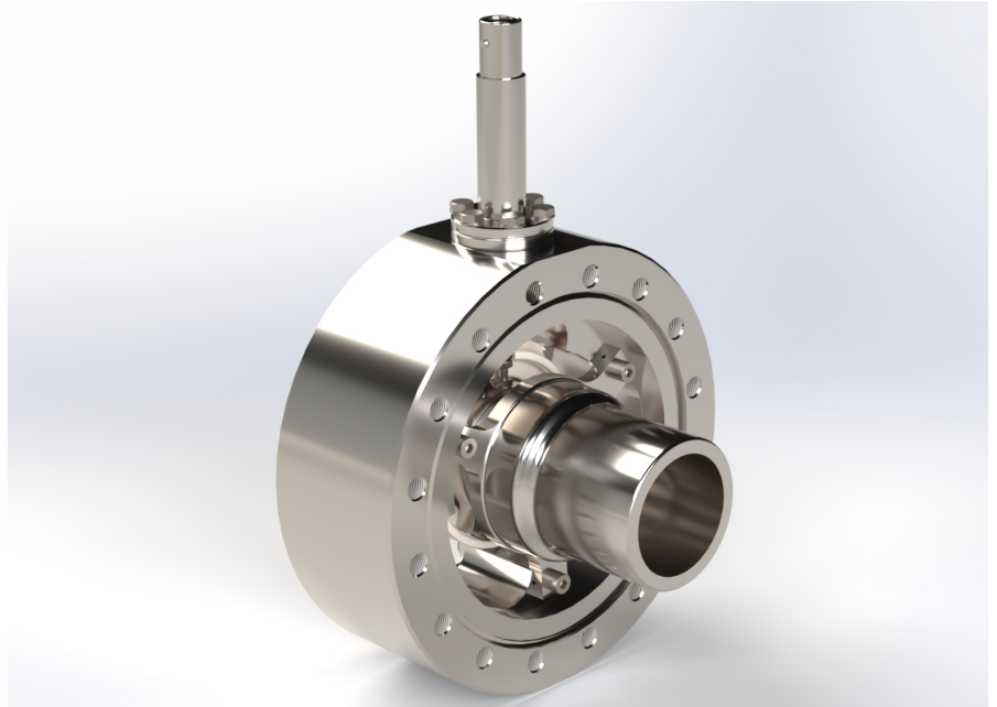
Einzel lens CF100, central mount, stainless steel.

Electrostatic lenses can be used in broad pressure ranges, down to ultra-high vacuum conditions.