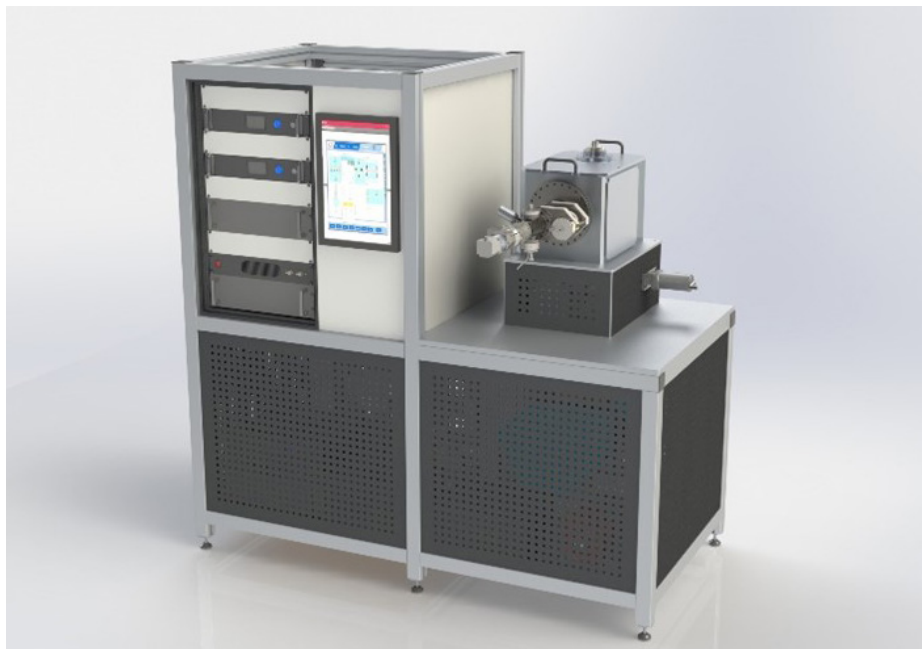
Configurable Ion Irradiation and Implantation Facility for ion beams of up to emA and sample sizes of up to 200 mm.

further reading and related products: Electron Cyclotron Resonance Ion Source Wien filter