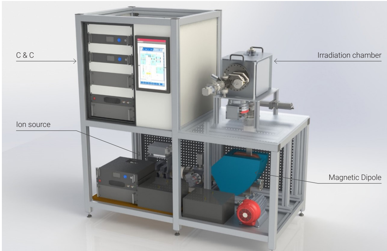
D.I.S Ion irradiation and implantation facility with magnetic dipole and irradiation chamber configuration. Some components of the HV shielding are hidden for more details.